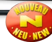
OFFSHORE HARD WORK