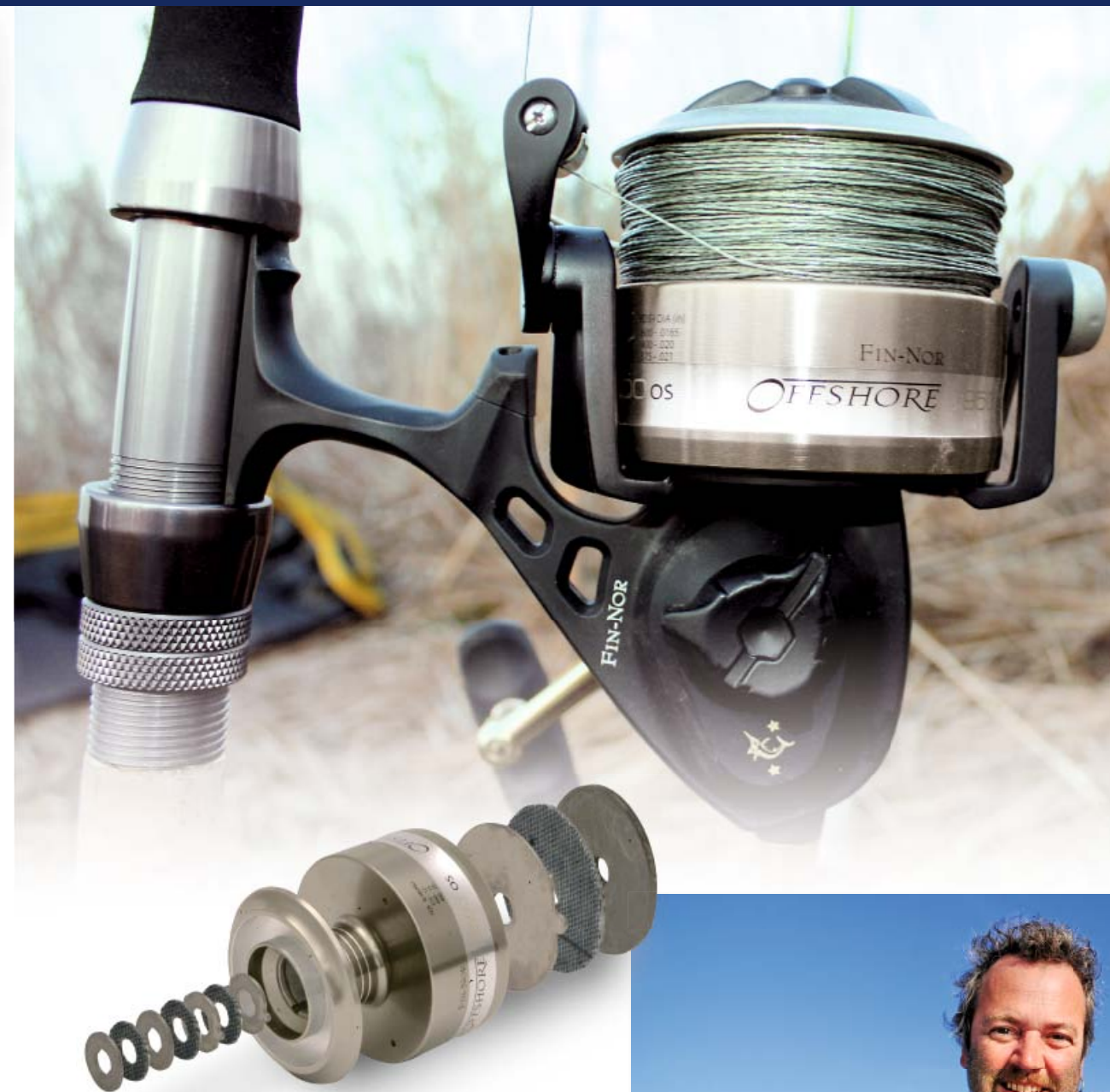
OVERSIZED MULTI-STACK OFFSHORE DRAG SYSTEM Fin-Nor's Offshore® spinning reels feature up to 10 carbon fibre, aluminum and stainless steel drag washers that are designed specifically to handle the ocean's biggest fish.