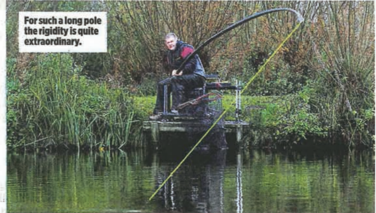
For such a long pole the rigidity is quite extraordinary.

the pole at its full length, I can report that in my opinion the Z12 Evolution may well be the best flagship pole currently available. It has the stiffness, tip speed, section wall strength, balance and speed of shipping that puts it up there with any flagship pole on the market. When you consider that it comes with eight top kits of your choice, plus the pole protection system that protects section ends from damage, Browning may after all have just launched the best pole in the world.